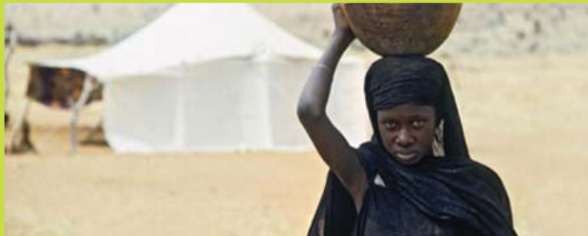
A girl performs domestic labour in a rural Mauritanian encampment. The International Labour Organization estimates there are at least 10 million working children in Africa alone.

Info & Photo from: http://www.un.org/en/rights/